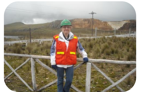
Yanacocha mine, Peru 2011

Actively engaging in peer learning with a number of recourse mechanisms, most significantly the international accountability mechanisms (IAMs) of the international