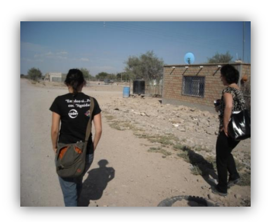
Meeting requesters July 2011