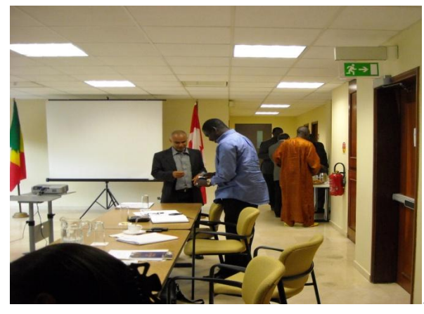
Roundtable dialogue, Senegal, 2010

In creating the process, stakeholders were proactively solicited to provide input. More than 300 individuals and organizations participated in our formal public consultations, about 40% from overseas, including dozens of civil society groups we met with in Mali, Senegal and Mexico.