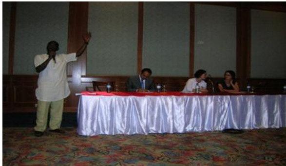
West Africa Outreach 2011