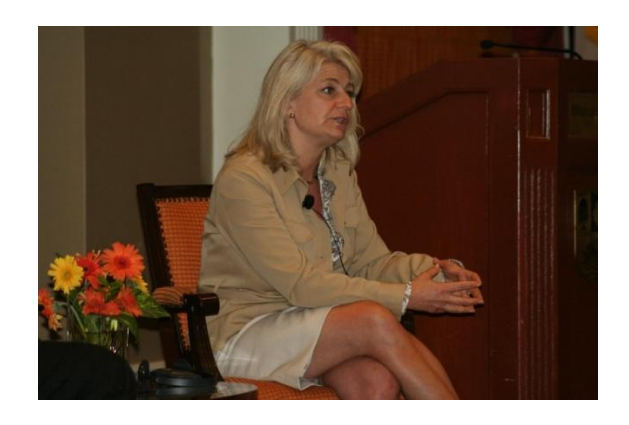
Speaking at the Peru CSR Forum, Lima, 2011