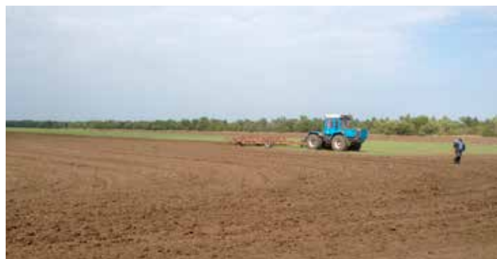
The HRIA team visited two sugar beet plantations in Russia. This one is located near Krasnodar, about 1,400 km south of Moscow.

During every HRIA the assessment team also assesses Nestlé's supply chain. These could include high risk suppliers such as transport providers, security providers, construction companies, canteen and cleaning services. Furthermore, during every assessment one raw material of Nestlé's supply chain is included within the scope of the assessment. In the past 7 HRIAs the commodities have included coconuts, coffee, maize, milk and sugar beet. The assessment team conducts visits to farmers, farm workers, processing mills, farmer cooperatives and local communities to assess Nestlé's potential and actual human rights impact on farmers, farm workers and communities.