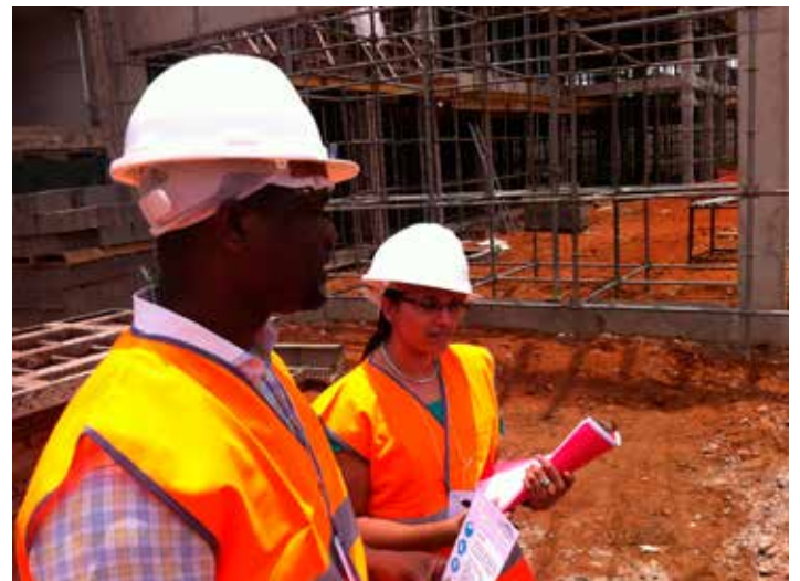
The HRIA team conducted a number of interviews with contractor's workers at the Nestlé factory construction site, Angola factory construction site, Angola

Employees in the Nestlé factories and distribution centers are interviewed through focus group interviews. Small groups of 4-5 employees with similar characteristics (for example a group of women, or a group of unionized employees) are asked open questions in order to allow the employees to speak openly about human rights impacts and issues they experience. 20 When speaking to women employees the assessment team tries to have a female assessor who conducts the focus group to ensure that women can freely speak about gender-specific issues. Employees are selected according to random selection.