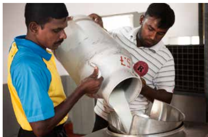
Nestlé Lanka buys 80 per cent of its daily milk requirements – a total of 147,000 kg each day— from 18,000 farmers in Sri Lanka.

Wherever possible the assessment team works with local consultants during the HRIAs. The DIHR assessment team consists of one or two DIHR staff members who are Human Rights and Business experts and 1 DIHR country expert or an in-country based expert who is known to DIHR through its extensive worldwide network of national human rights institutions, civil society partners or individual human rights experts.