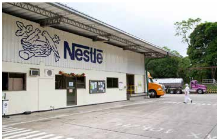
Nestlé distribution center, Colombia. Nestlé products are transported here by truck before being distributed to customers.

Nestlé Colombia has been the only Nestlé Market that has conducted such an extensive human rights training programme for all its security personnel, which include Nestlé and contracted security guards. The training has been much appreciated by security personnel as well as Nestlé employees, particularly acknowledging the fact that the training has been conducted by an independent expert organization.