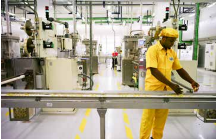
Production line operator, Nestlé Flowergate factory, Nigeria. Strong health & safety procedures and performance were observed in all the Nestlé facilities visited by the HRIA team.

“The HRIA visit raised the awareness on human rights issues, increasing our focus on them within what are our priorities.”