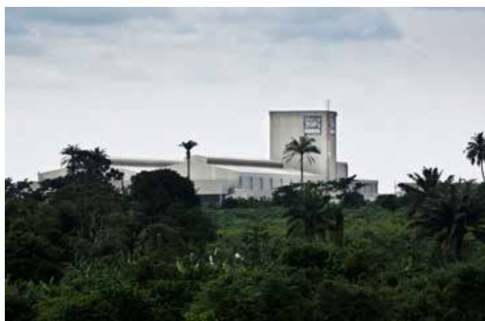
The Nestlé Flowergate factory in Nigeria was inaugurated in February 2011.

Today, there are plans to replicate the model of the Flowergate factory in other locations. The Nestlé Nigeria Abaji Greenfield Water Factory is currently being built, where Nestlé is conducting a community consultative stakeholders' forum based on the model of Flowergate factory.