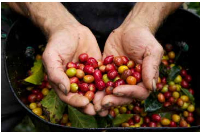
Coffee picking, Colombia.

Nestlé is a member of 4C, a multi-stakeholder platform aiming to improve the economic, social and environmental conditions of coffee farmers.