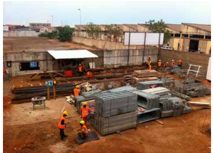
When the HRIA was carried out in Angola (2011), the first Nestlé factory in the country was being built.

To get a better understanding of the scope of Nestlé operations at country operation level, DIHR sends a scoping questionnaire to a designated appointed person in the Nestlé country office where the HRIA will be conducted. 14 This scoping questionnaire includes questions on the number of employees at the country head office, factories and distribution centers, disaggregated by job-type, number of female employees, trade unions, unionized employees, night workers, third party staff, the security situation, if land has been purchased or leased, if any construction or expansion of factories is taking place, the distance from the nearest by community, the commodities that are locally sourced etc. Secondly, there are a few questions included about sourcing of raw materials. This could be about the number of farms Nestlé directly or indirectly sources from, the number of farmers Nestlé sources from, and logistical questions such as the distance from the head office to the sourcing areas. The questionnaire concludes with a number of questions on Nestlé's Creating Shared Value (CSV) programme and the CSV projects related to water, nutrition and rural development that are carried out in the country of assessment. 15