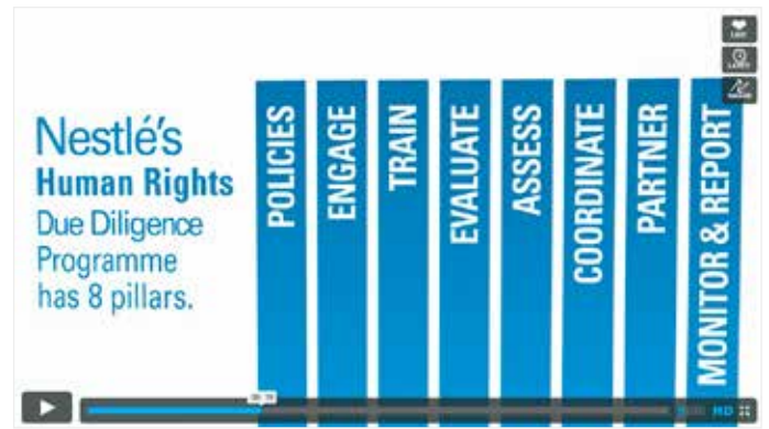
Nestlé's 8-pillar Human Rights Due Diligence Program: video 8

The 8 pillars of Nestlé's Human Rights Due Diligence Programme (HRDD) aim to make Nestlé's approach to human rights strategic, cross-cutting, comprehensive and coordinated.