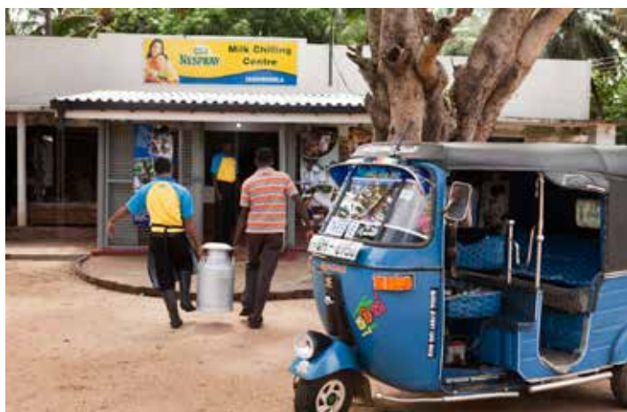
Nestlé milk collection centre, Sri Lanka. The HRIA team observed increased economic opportunities for dairy farming families in various parts of Sri Lanka, including in former North-Eastern conflict areas.

Key external stakeholders include civil society organizations, government agencies, national human rights institutions, academics, trade unions, UN agencies, including local UN Global Compact networks and individual issue or sector experts. The external stakeholders are identified based on their expertise on relevant issues, for example, labor rights in general, trade union rights, child labor, or the implementation of the World Health Organization (WHO) International Code of Marketing of Breast-milk Substitutes in the country in question. 16 The assessment also seeks input from the Nestlé country team on the external stakeholders. The team tries to interview stakeholders that have had previous interaction with Nestlé at the country-level and therefore can elaborate more on Nestlé's activities and actual and potential impacts.