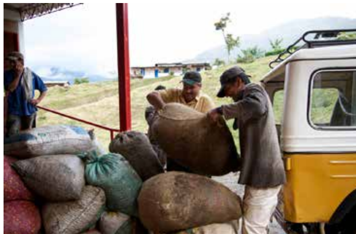
Farmers delivering coffee to a collection center, Colombia. The Nescafe Plan aims to boost farm productivity and incomes through the distribution of high-yield plantlets and technical training to farmers.

Nestlé's upstream supply chain, the Responsible Sourcing Guidelines (RSGs) include human rights requirements that have been identified for each commodity. Where relevant, commodity specific findings from the HRIAs, for example related to sourcing of coffee, have been fed into these RSGs. Issues identified through the HRIAs have also been fed into the revision of CARE, Nestlé's independent audit programme. CARE applies to Nestlé sites including head offices, factories and distribution centers and now includes a stand-alone section on human rights.