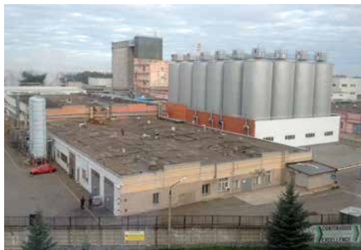
View over the industrial zone where the Nestlé Timashevsk factory is located, Russia

At Nestlé distribution centers the assessment team focuses on human resources, health and safety, security and community impacts. Interviews are held with management, HR managers, Health and safety managers, security managers and with distribution center employees. The team also speaks to relevant suppliers such as third party transport staff.