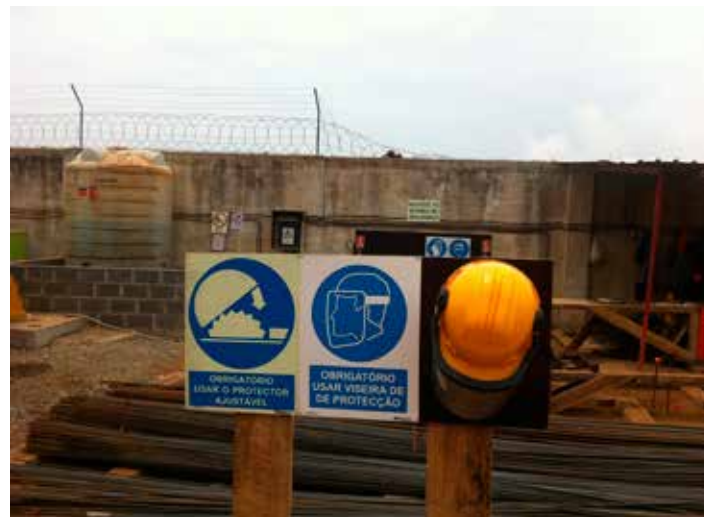
At the time of the HRIA in Angola (2011), 64 people were working on the Nestlé construction site.