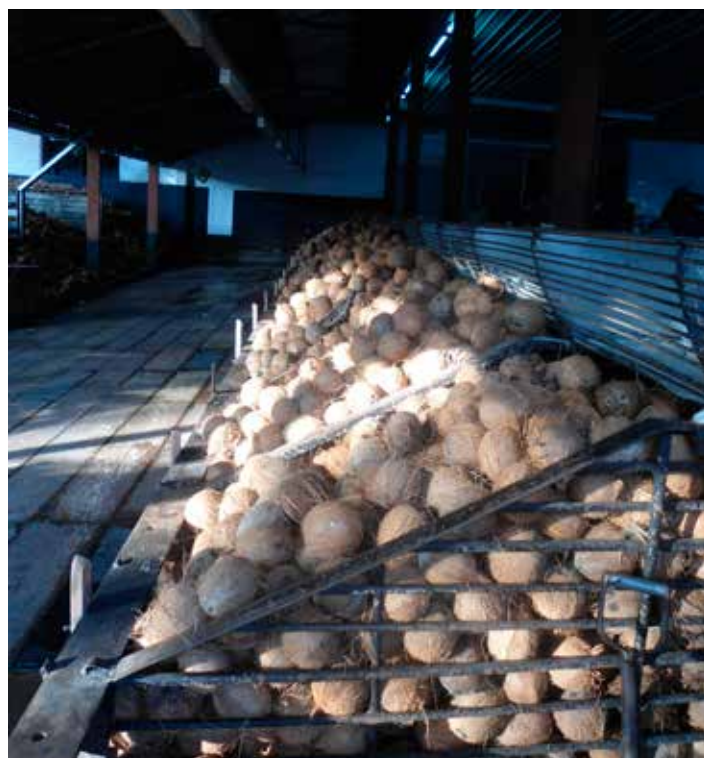
Coconut processing mill, Sri Lanka. This where the coconuts paring and hatching take place before being transported to the Nestlé factory.