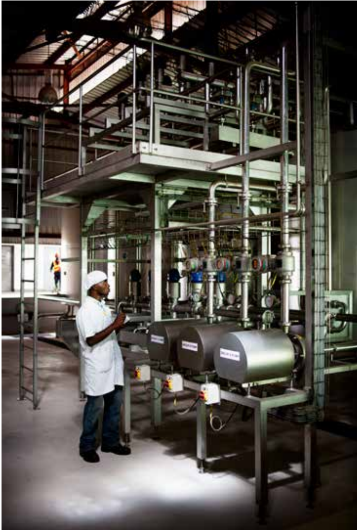
Machine operator, Nestlé factory, Nigeria

The country level HRIAs are guided by a set of self-assessment questionnaires developed by DIHR in collaboration with Nestlé HQ. The self-assessment questionnaires are based on DIHR's Human Rights Compliance Assessment Tool (HRCA) , a comprehensive tool designed to detect human rights risks in company operations. The tool covers all internationally recognized human rights and all relevant stakeholders, including employees, farmers, local communities, customers and host governments. 18